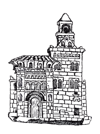
A RELIEF ON THE SANTA CATALINA (ST. CATHERINE) DOOR SHOWING THE ORIGINAL MINARET (1565)